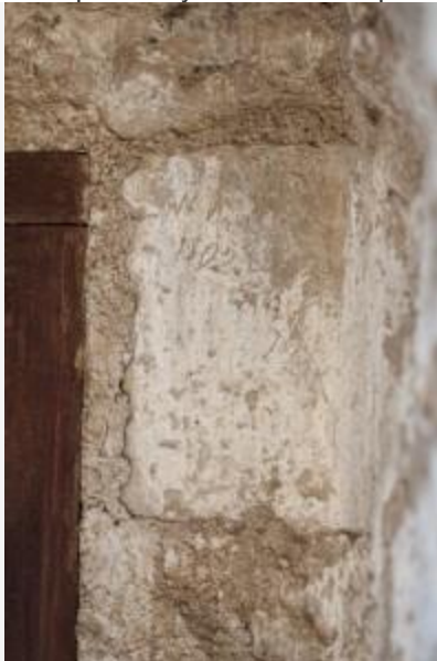
The Alamo "1802"

The Alamo Shrine roof is almost complete and most of the scaffolding has been removed. The roof was painted with leak preventing Hydro-Stop and it was so green it looked like a golf course. Engineering work is still underway but repairs might be completed by the end of September.